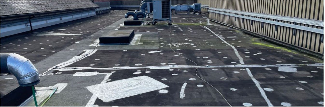
Patch repair on membrane