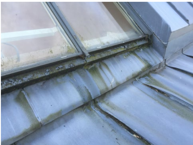
Regular cleaning required