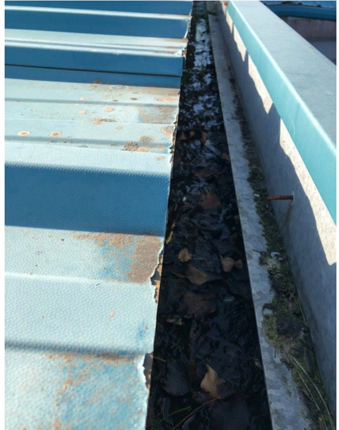
Debris in gutters