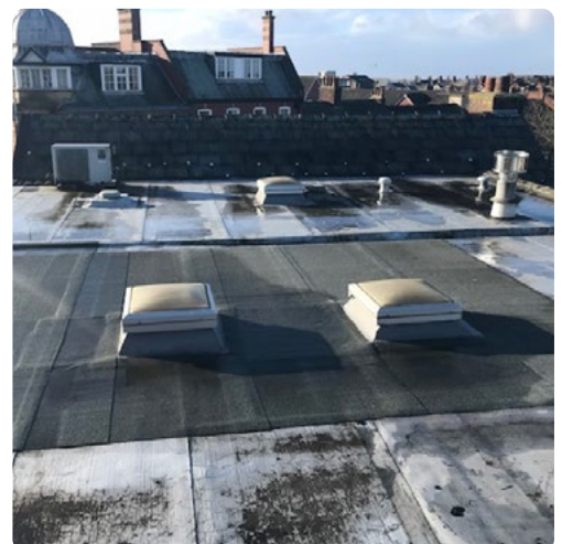
The department store had begun to suffer from a series of leaks